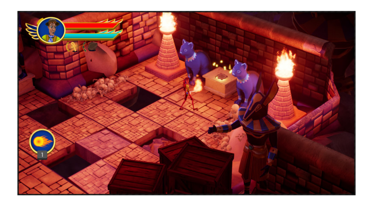
Download ->>> http://bit.ly/2SL2i7e